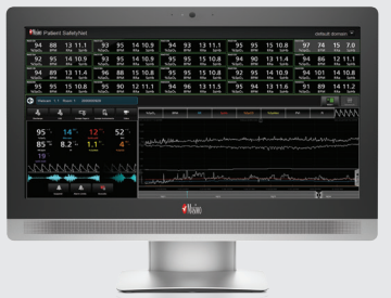
Patient SafetyNet View Station Supplemental Remote Monitoring and Clinician Alarm Notification