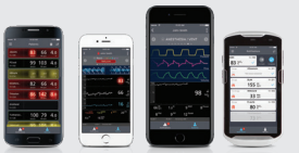
Replica™ Mobile Application for Supplemental Remote Monitoring and Clinician Alarm Notification