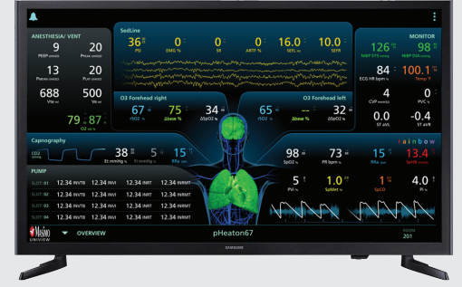
UniView™ Intelligent Display for Next Generation Data Aggregation and Alarm Visualization